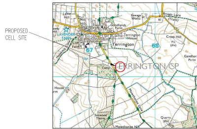
LOCATION PLAN SCALE 1:25000

REPRODUCED FROM ORDNANCE SURVEY PROMAP DATA © CROWN COPYRIGHT 2016 LICENCE NUMBER 100020449